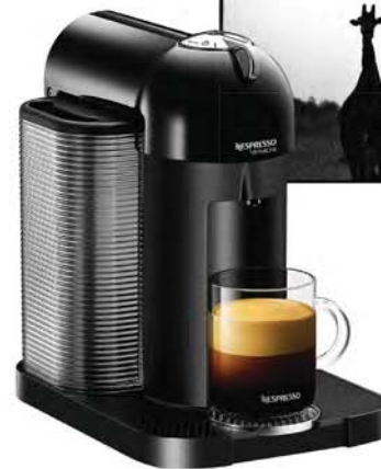
NESPRESSO VERTUOLINE $300, THEBAY.COM.