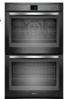
BLACK ICE DOUBLE WALL OVEN $2,999, WHIRLPOOL.CA.

"A galley kitchen was the only option for our home – it allows for an open walkway through the first floor and keeps the view to the backyard open as well."