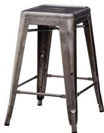
CARLISLE METAL COUNTER STOOL $99/FOR 2, TARGET.CA