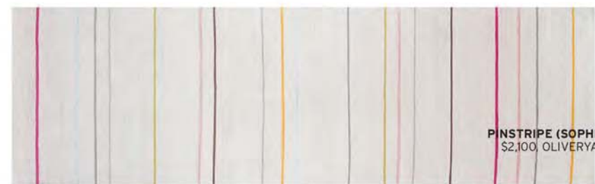
PINSTRIP (SOPHIE) RUNNER $2,100, OLIVERIYAPHE.COM.