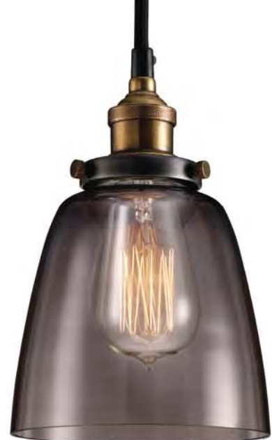
20TH-CENTURY FACTORY FILAMENT SMOKE GLASS PENDANT $130, RESTORATIONHARDWARE.COM.

With clean lines and a basic black and white palette, any decorative touches add big impact