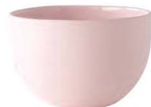
MUD AUSTRALIA PINK BOWL $37, GRETELHOME.COM.