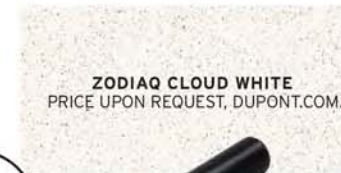
ZODIAQ CLOUD WHITE PRICE UPON REQUEST, DUPONT.COM.