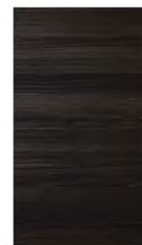
AKURUM/GNOSJO CABINETS $69/LINEAR FT., IKEA.CA.

Choose flat door fronts with streamlined handles to achieve this minimalist look. Engineered quartz works for both backsplash and counters.