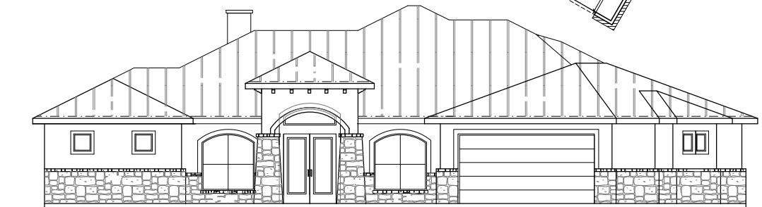
FRONT ELEVATION NOT TO SCALE