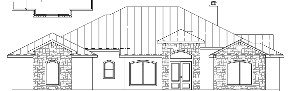
FRONT ELEVATION NOT TO SCALE