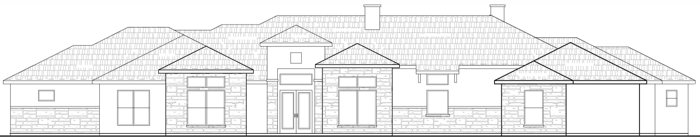
FRONT ELEVATION NOT TO SCALE