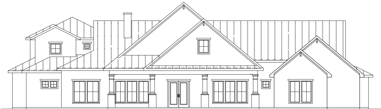
FRONT ELEVATION NOT TO SCALE